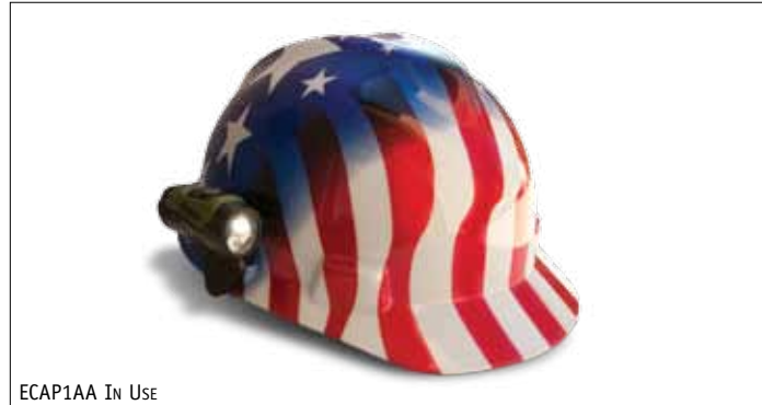
ECAP1AA In Use