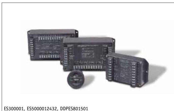
ES300001, ES5000012432, DDPE801501